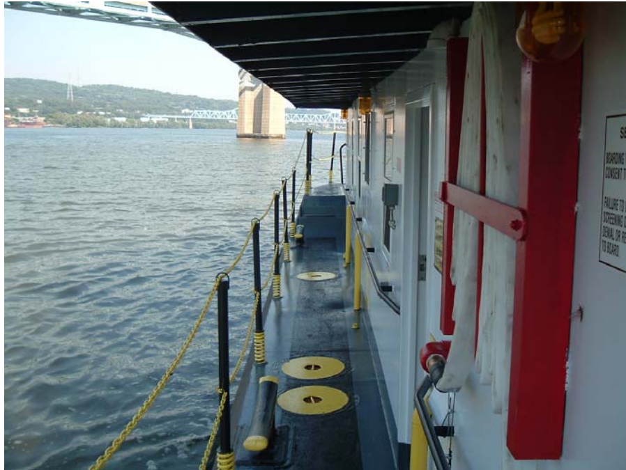
Stbd. Side – Main Deck