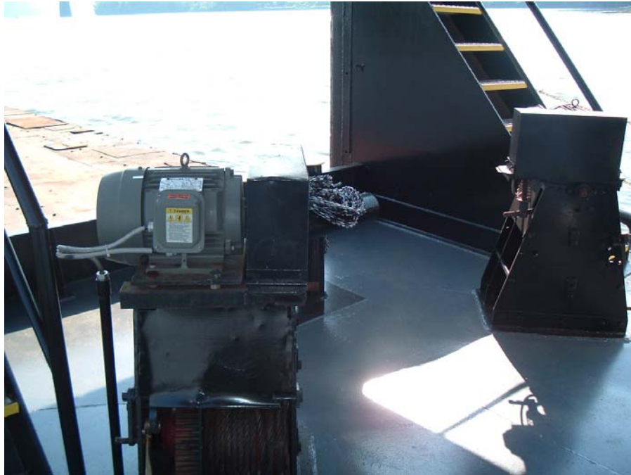
Bow, Main Deck