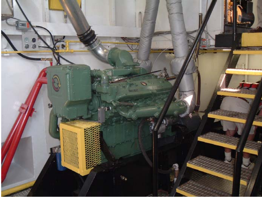
Stbd Main Engine