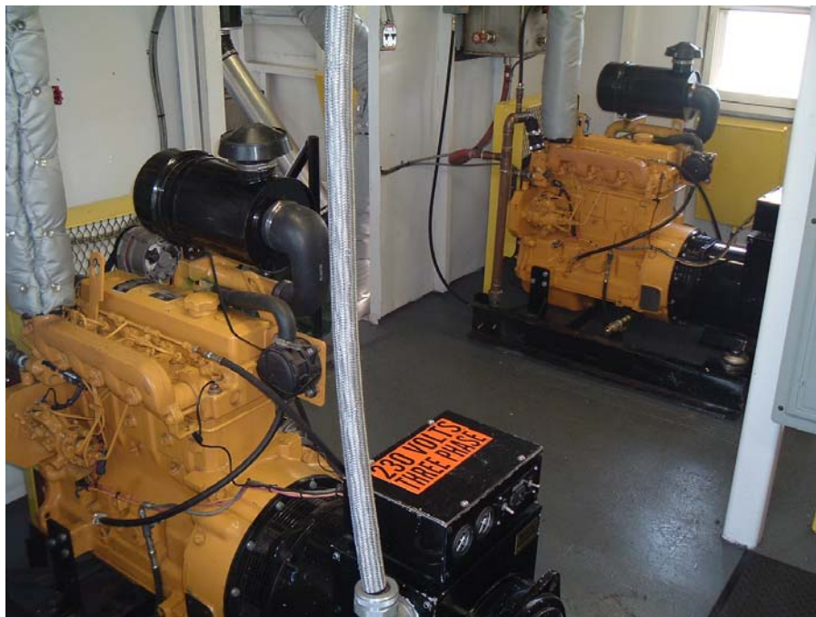
Generator Room – Aft Main Deck