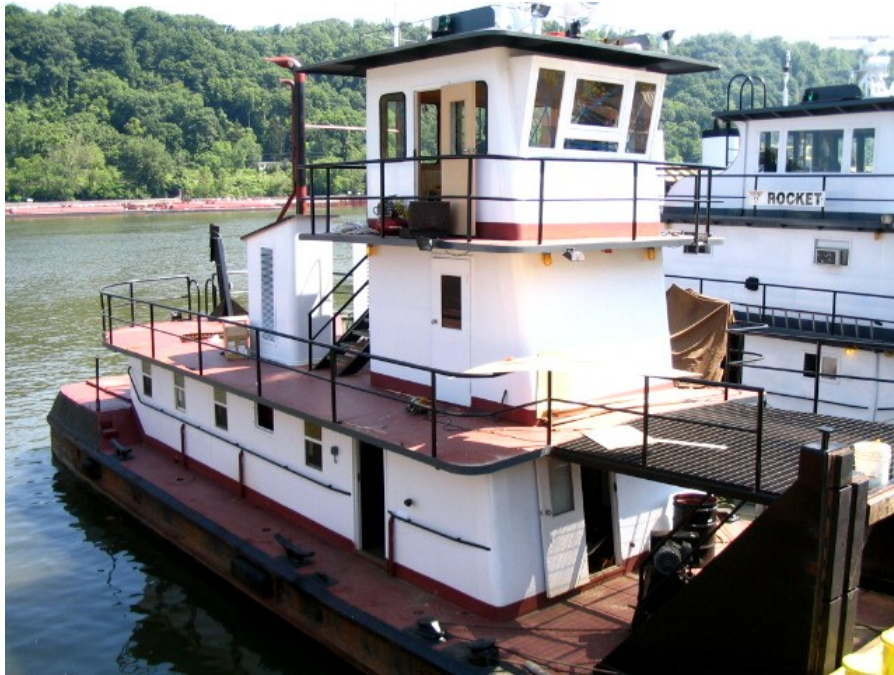
MV Bonnie C. – Stbd Bow View