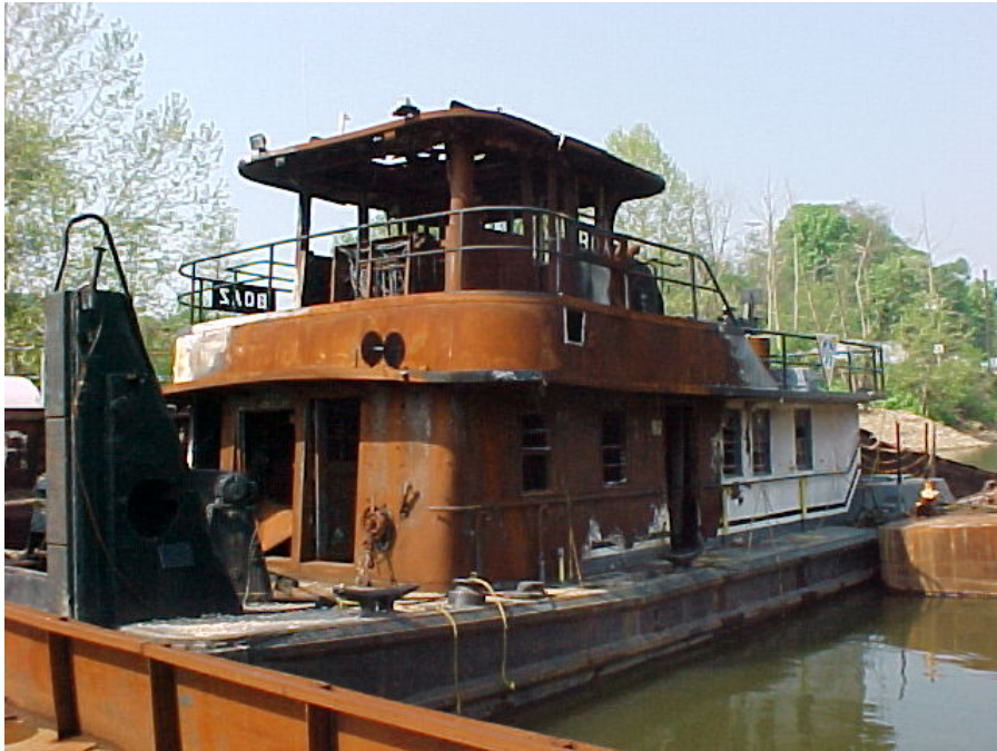
MV Boaz After Fire – Port Bow View