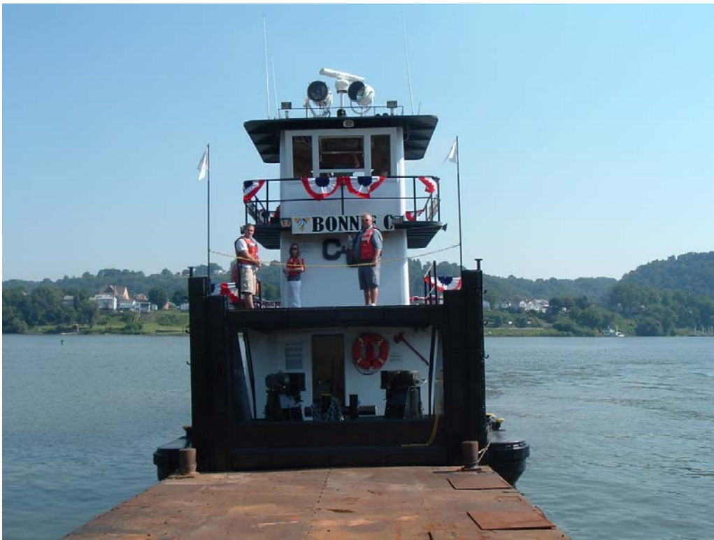
M/V Bonnie C. – View looking at Bow