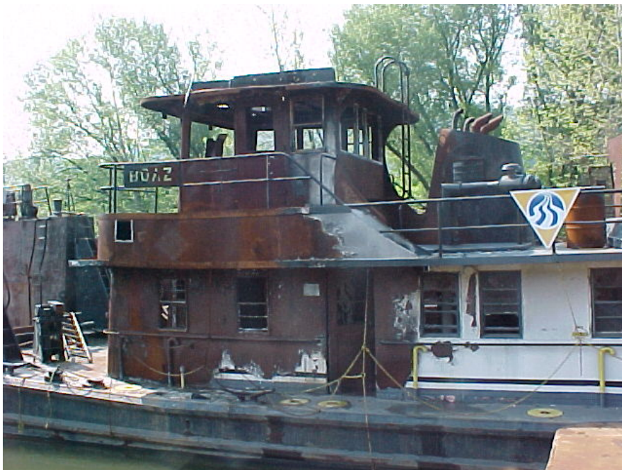
M/V Boaz After Fire – Port Profile