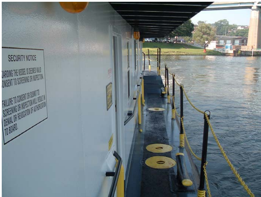
Port Side – Main Deck