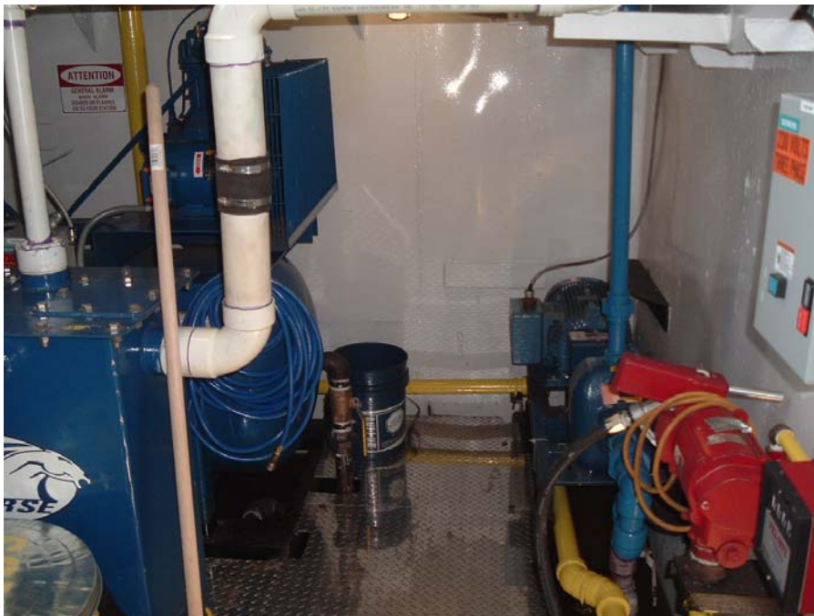
Lower E/R – Looking Forward